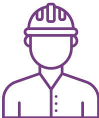
Horne Smelter employees