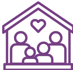
Families of Horne Smelter employees